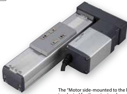
The "Motor side-mounted to the left (ML)" option is selected for the actuator shown above.