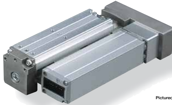
Pictured: TA3R with left-mounted motor (ML).