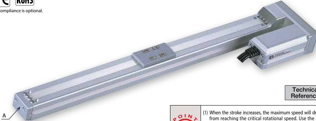
Pictured: Left-mounted motor model (ML).

*This product is equipped with a position adjusting screw at the A area shown above. (See dimensional drawing on the page to the right.)