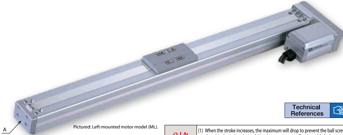
Pictured: Left-mounted motor model (ML).